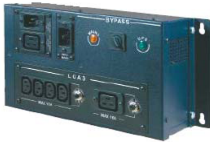
APS Bypass Wall Mounted Version

If the UPS is disconnected or fails, any load connected to the bypass switch is automatically transferred to the mains supply.