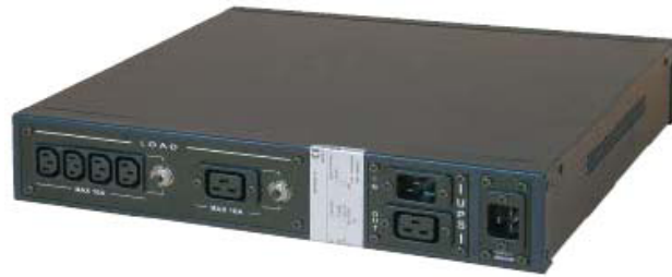
APS Bypass Rack Mounted Version – Rear View